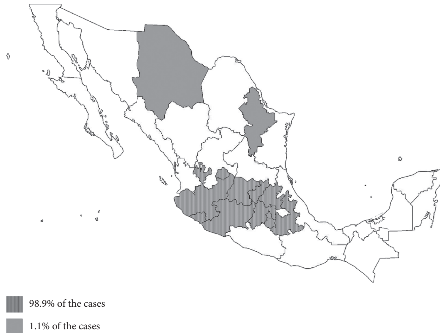
FIGURE 1: Geographic distribution of cases of silica urolithiasis in Mexico.